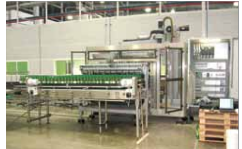
High-speed infeed machine for bottles: physical prototype