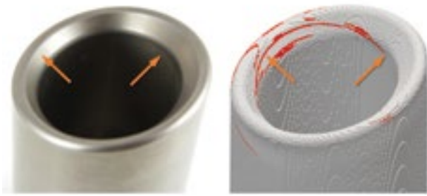
Figure 4 Detection of shrink lines with the new function inside Simufact Additive