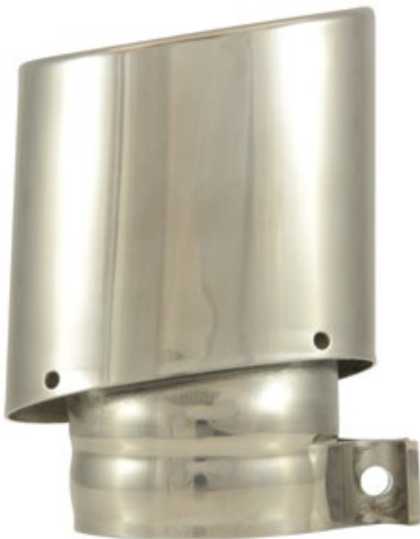
Figure 2 Re-designed, printed and post-processed tail pipe blend of sports car Porsche GT2 RS

AM rarely make sense without exploiting the potential of redesign. A redesign has to consider not only specific parts but also all surrounding components, functions and assembly steps. For the present application, realized redesign advantages are short time to market due to tool-free manufacturing, increase of quality due to homogenous material properties, reduction of number of parts – and thus less assembly steps – and potential for customized design.