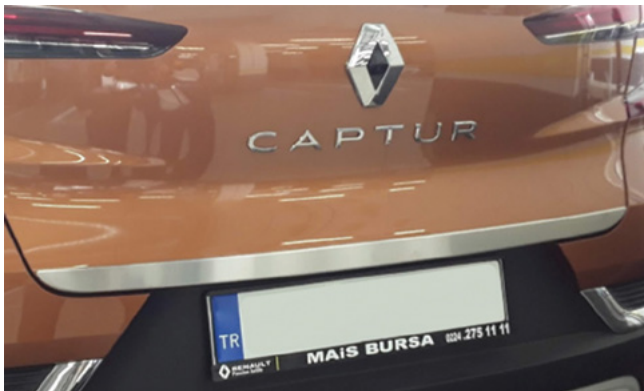
Final Component assembled on the vehicle