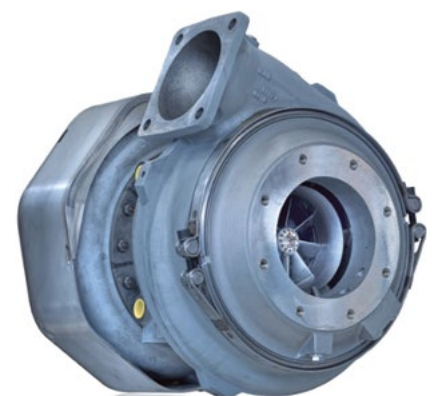
Image 2: From design to simulation to the finished component – less distortions thanks to Simufact Additive.